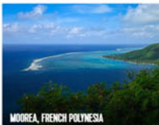
MOOREA, FRENCH POLYNESIA