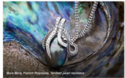
Bora Bora, French Polynesia, Tahitian pearl necklace

Bora Bora's cuisine brings a mix of French, Asian and Tahitian flavors to the local seafood bounty. Looking for a breakfast fit to fuel a hike up Mount Otemanu. Try firi firi , a Tahitian donut that's also made with the ever-present coconut milk. Don't leave without trying the French Polynesian specialty, poisson cru , a ceviche of Tahitian ahi tuna in coconut milk and lime juice.