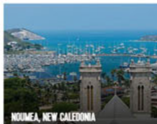
NOUMEA, NEW CALEDONIA