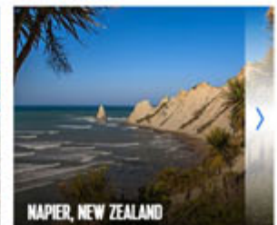
NAPIER, NEW ZEALAND