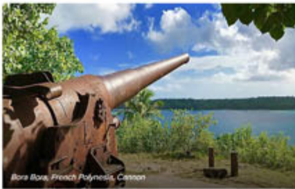
Bora Bora, French Polynesia, Cannon