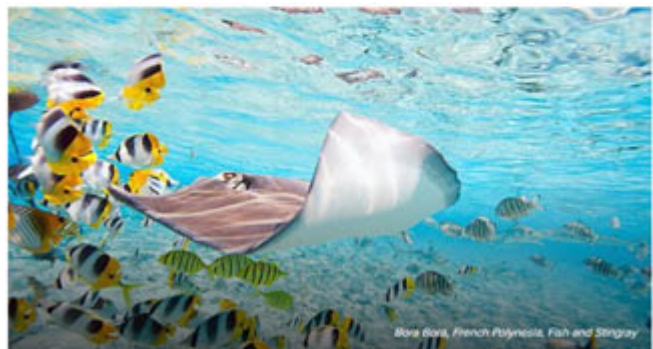
Bora Bora, French Polynesia, Fish and Stingray

Let a guided boat get you up close to the rainbow of underwater wildlife of Bora Bora. Observe black-tipped sharks via snorkel, or feed some of the friendly mantas while you enjoy the clear, calm waters.