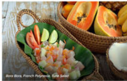
Bora Bora, French Polynesia, Tuna Salad

Explore the island on a 4x4 tour to hear the fascinating history of Bora Bora, spanning its ancient Polynesian past to its role as a military base in World War II. Whether it's a champagne tour or a hearty jungle trek, you can learn at exactly your speed.