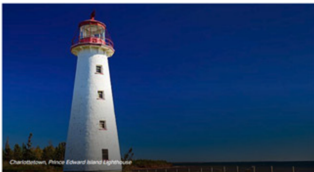
Charlottetown, Prince Edward Island Lighthouse