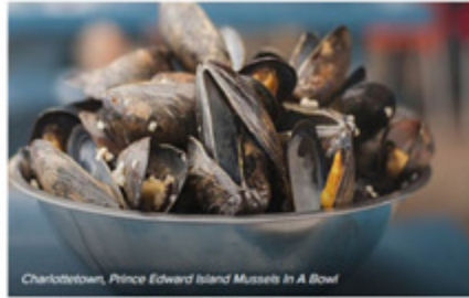
Charlottetown, Prince Edward Island Mussels In A Bowl