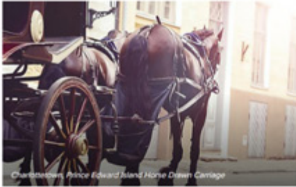
Charlottetown, Prince Edward Island Horse Drawn Carriage