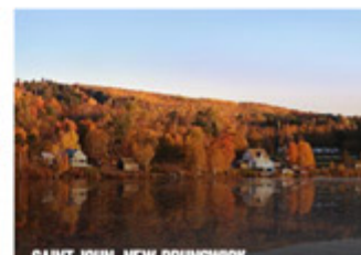
SAINT JOHN, NEW BRUNSWICK