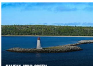
HALIBUT, NEW SCOTIA