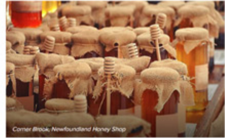
Corner Brook, Newfoundland Honey Shop