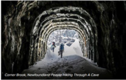
Corner Brook, Newfoundland People Hiking Through A Cave