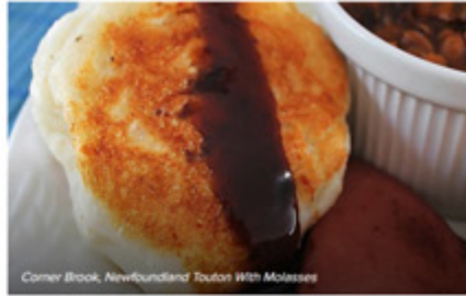
Corner Brook, Newfoundland Touton With Molasses