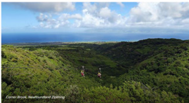
Corner Brook, Newfoundland Zip-lining