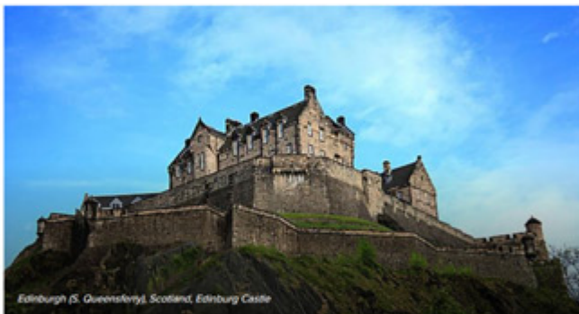
Edinburgh (S. Queensferry), Scotland, Edinburgh Castle