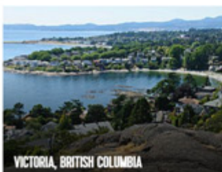
VICTORIA, BRITISH COLUMBIA