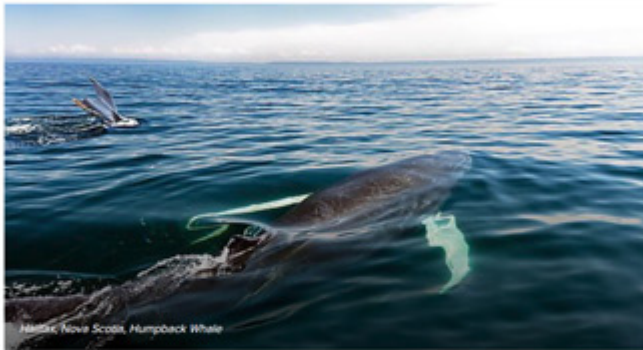
Halifax, Nova Scotia, Humpback Whale