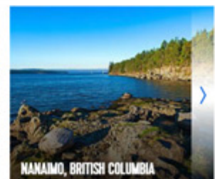
NANAIMO, BRITISH COLUMBIA