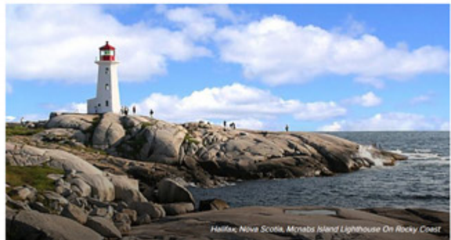
Halifax, Nova Scotia, Monks Island Lighthouse On Rocky Coast

Nova Scotia is home to 160 lighthouses, and you can get to many of them easily from Halifax. Visit the most photographed lighthouse in the world at Peggy's Cove, just a one-hour drive from the city. Or head to the Cape d'Or Lighthouse, where you'll find some of the best panoramic views around.