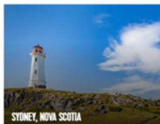
SYDNEY, NOVA SCOTIA