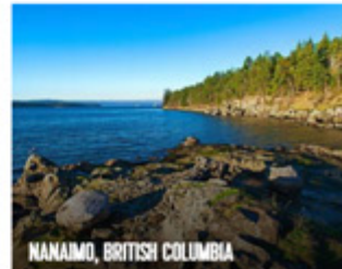
NANAIMO, BRITISH COLUMBIA