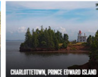
CHARLOTTETOWN, PRINCE EDWARD ISLAND