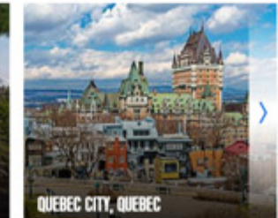
QUEBEC CITY, QUEBEC