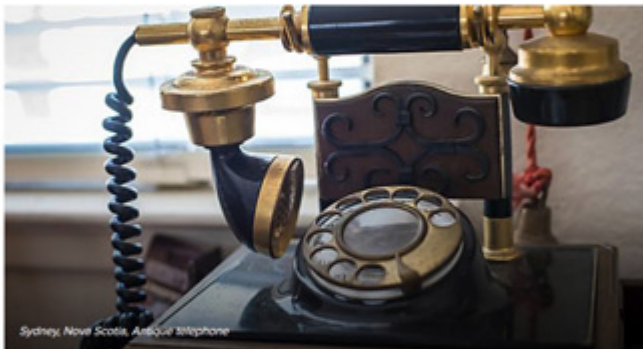
Sydney, Nova Scotia, Antique Telephone