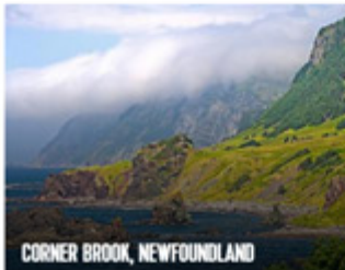
CORNER BROOK, NEWFOUNDLAND