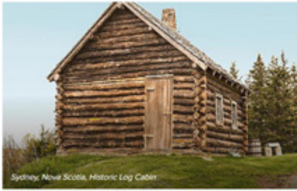
Sydney, Nova Scotia, Historic Log Cabin