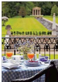
Terrace dining offers sweeping views of the grounds.

Ireland's Ballyfin combines old-world charm with luxurious style