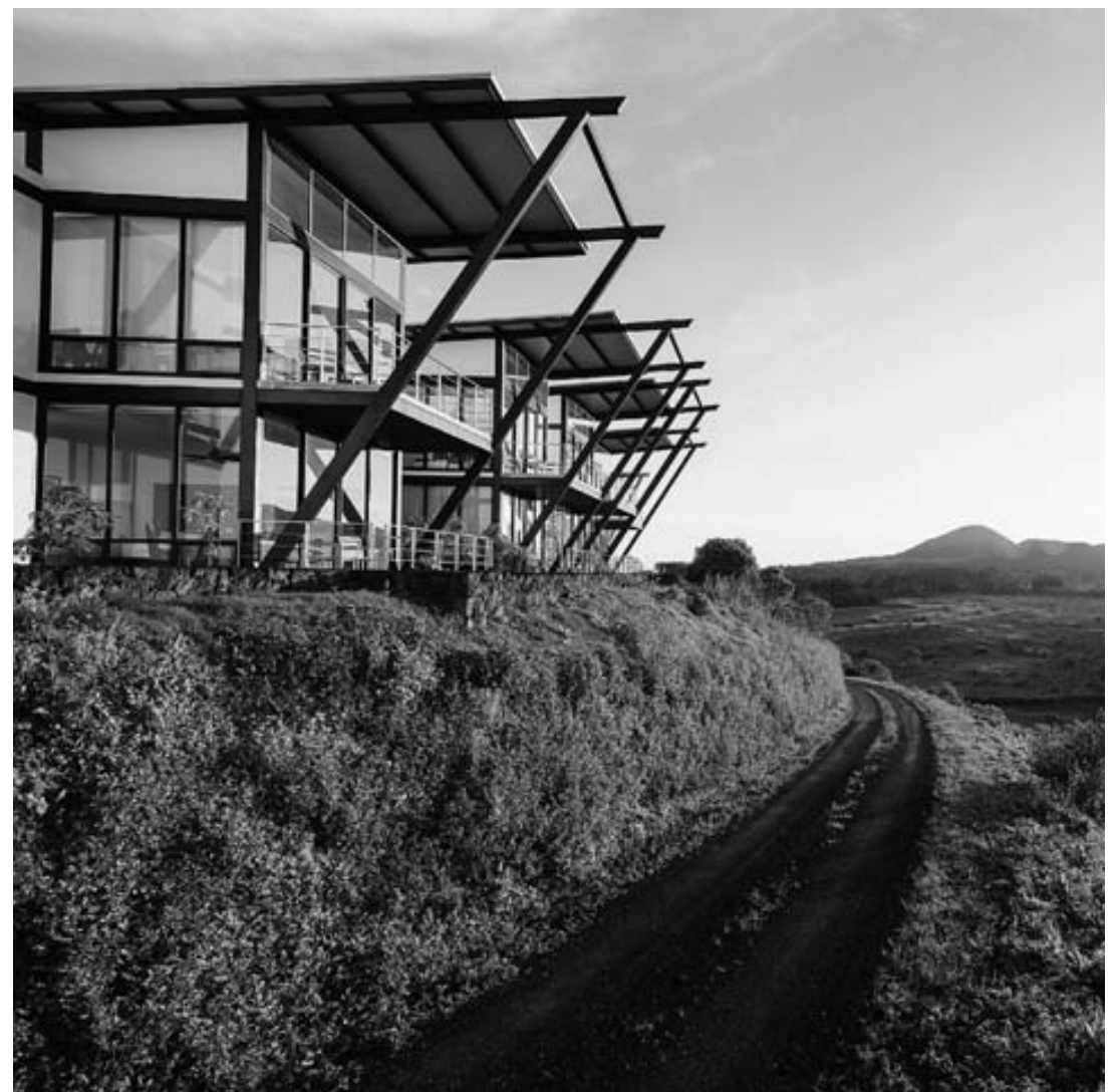
The Pikaia Lodge has 14 suites and is constructed of recycled steel, glass and natural stone.