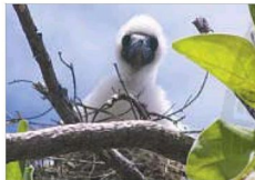
A red-footed booby chick awaits its meal. Beware the dive-bombing mama birds.

The next day we take an excursion by sea to Bird Island with Bichou Raufan, our charming Tuamotu host. We whirl past an abandoned pearl farm built on stilts and dock at an avian utopia. Thousands of birds are circling.