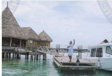
A local guide waves goodbye after a playful traditional blow of the conch.

If globally we cannot become more accountable, it's