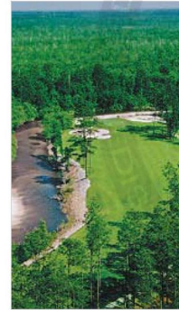
Grand Bear Golf Course The par-4 17th hole on Jack Nicklaus' Grand Bear Golf Course is a sharp dogleg next to the Big Biloxi River.