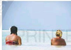
Locals take an afternoon break in Tikehau's pristine waters.

Much of the Tuamotu Archipelago sits dubiously close to sea level.